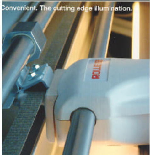
Convenient. The cutting edge illumination.