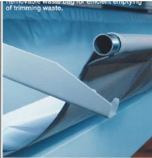
Removable waste bag for efficient emptying of trimming waste.