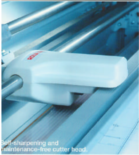
Self-sharpening and maintenance-free cutter head.