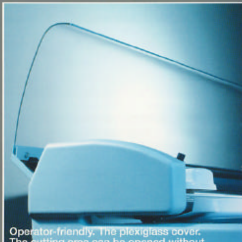
Operator-friendly. The plexiglass cover. The cutting area can be opened without