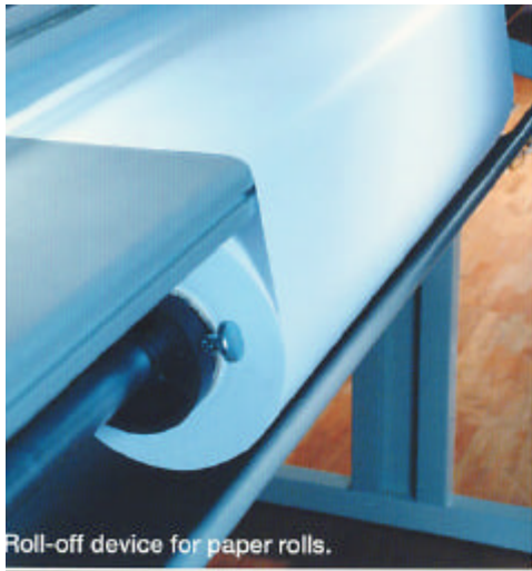
Roll-off device for paper rolls.