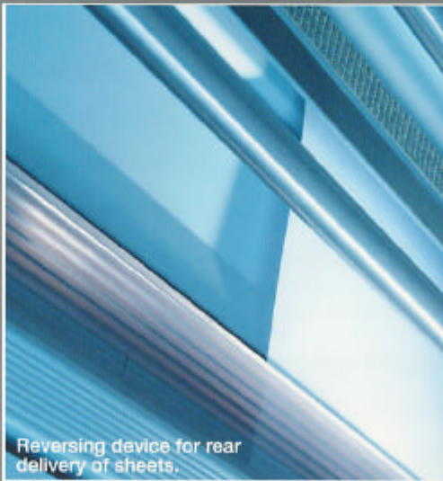
Reversing device for rear delivery of sheets.