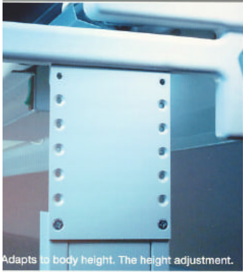
Adapts to body height. The height adjustment.