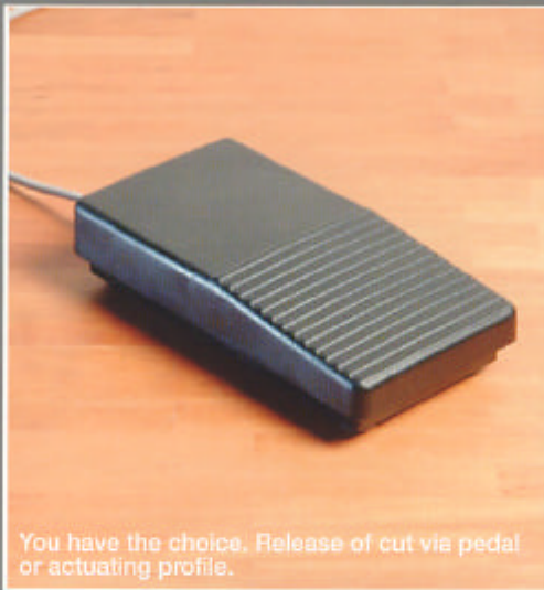
You have the choice. Release of cut via pedal or actuating profile.